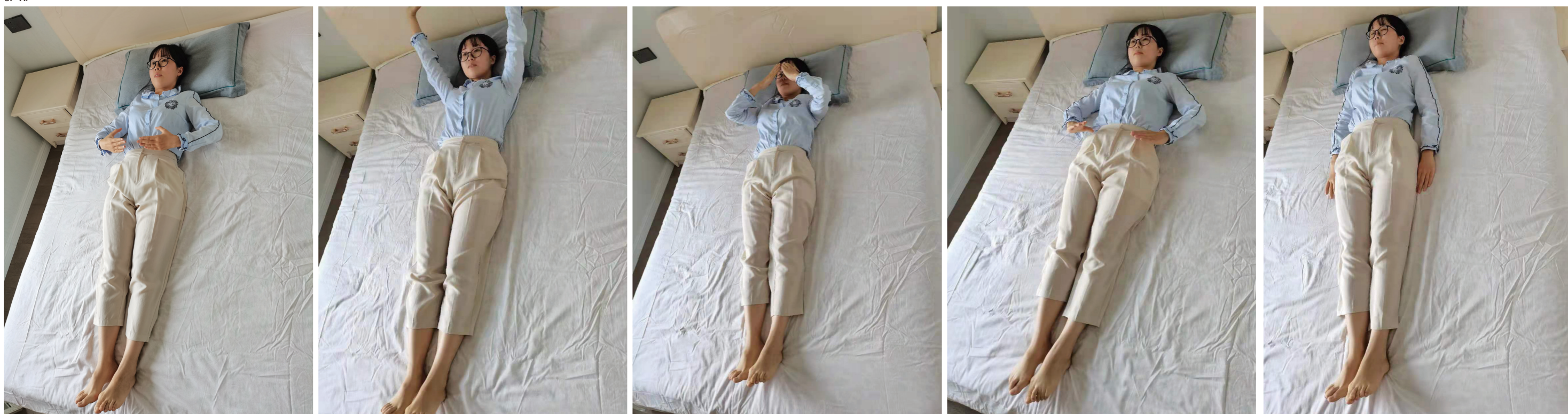
Figure S1 Specific exercise methods of sitting and lying Liuzijue. This image is published with the participant's consent.