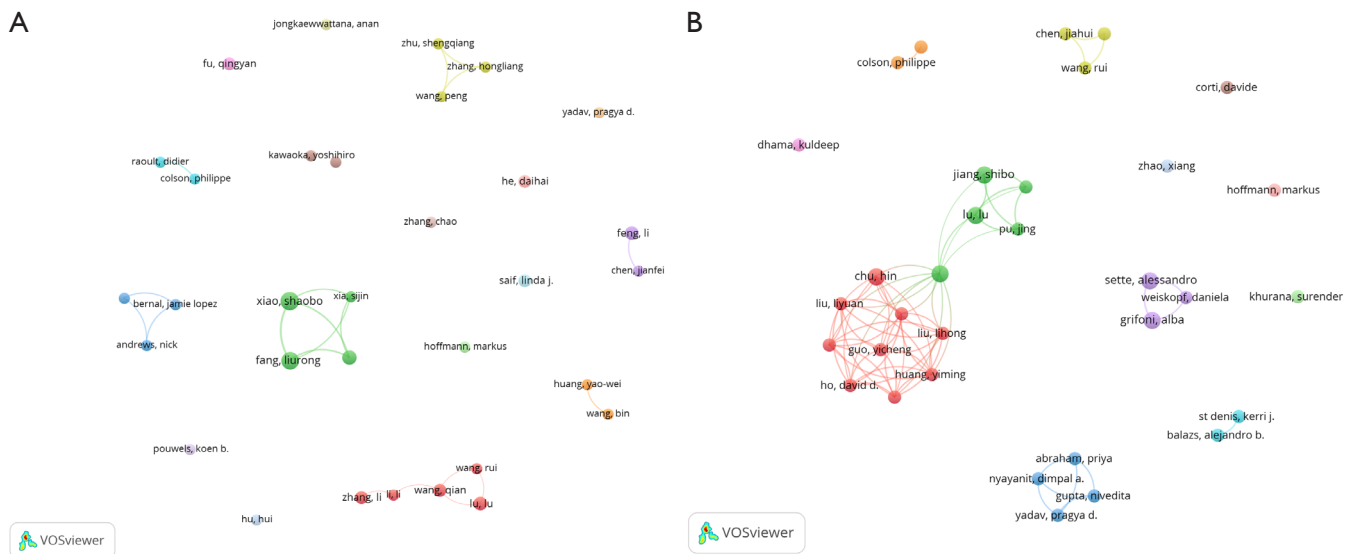
Figure S2 Network map of authors. (A) Cooperation of Delta in COVID-19 pandemic (32 authors over 5 articles were included in the map). (B) Cooperation of Omicron in COVID-19 pandemic (33 authors over 3 articles were included in the map). Nodes demonstrates the different authors and the lines indicate the cooperation. COVID-19, coronavirus disease 2019.