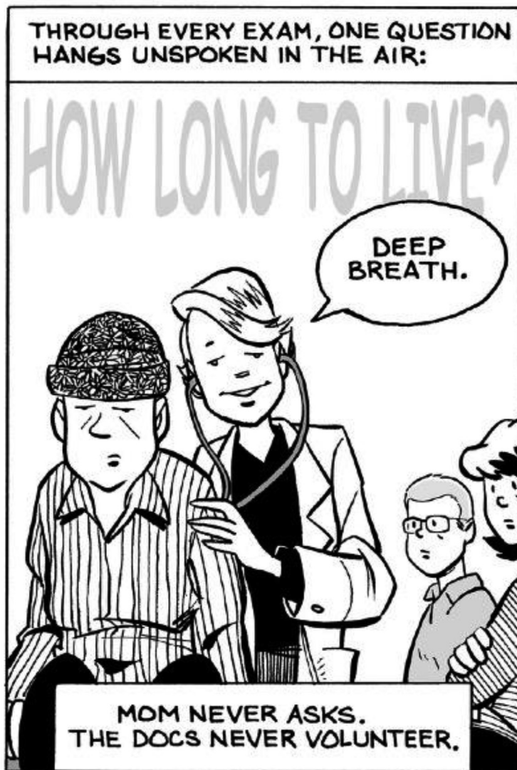
Illustration 3 Communication about prognosis (23). Permission for illustration by copyright holder: Brian Fies.