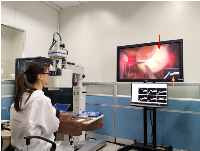
Figure S1 The microscope integrated optical coherence tomography (MIOCT) and external 3D head-up visualization system. The MIOCT images (yellow arrow) and surgical microscopic images (red arrow) are simultaneously projected on the external 3D head up display.

*Statistical values were calculated from the reliability analysis (*P < 0.05)