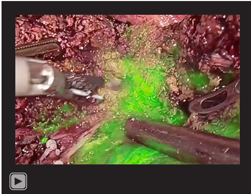
Video S1 NIF-guided laparoscopic hepatectomy via positive biliary approach staining. NIF, near-infrared fluorescence.