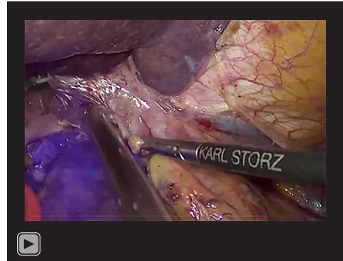
Video S3 NIF-guided laparoscopic hepatectomy via negative biliary approach (puncturing the CBD) staining. NIF, near-infrared fluorescence; CBD, common bile duct.