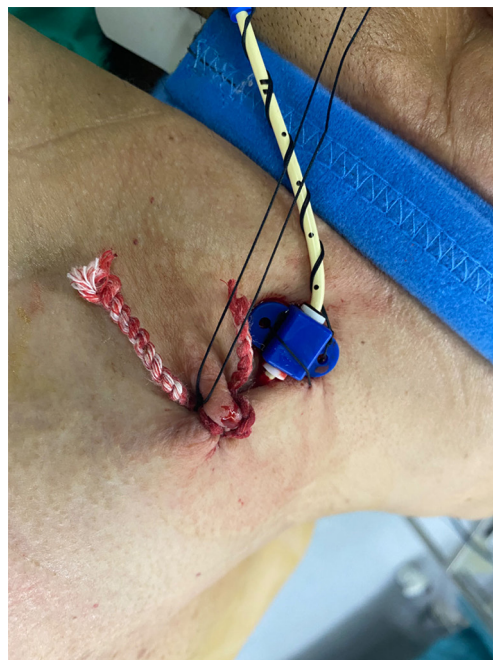
Figure S3 Skin incision of the right jugular cannula.