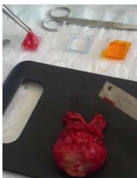
Preparation of a prostate apex; saline, and orange acridine staining for 30 seconds