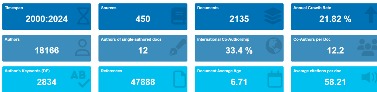
Figure S1 Publications distribution by country.