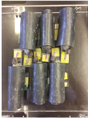
Figure S1 The device to fix mice for irradiation. During irradiation, the head, trunk, and left leg of mice are shielded by lead plates, while the tumor-bearing right leg fixed with adhesive tapes is not shielded. Although the mice are different from those used in this study, the same device was used.