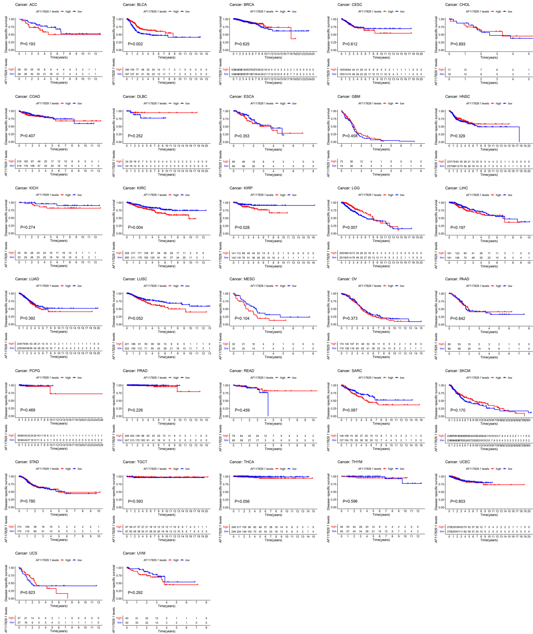
Figure S2 Prognostic value of AF117829.1 on disease-specific survival for pan-cancer with Kaplan-Meier plotter.