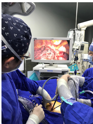
Figure 3 Intraoperative finger touch is used to determine the location of the pulmonary nodules.

position single-intercostal two-port VATS is suitable for all patients with well-developed fissures, and the upper lobe of the right lung and the lower lobe of the left lung are the most suitable sites for this surgical procedure. For patients with fissure hypoplasia, the first surgical step is usually to detach the horizontal or oblique fissure by tunneling with a cutting stapler. In this study, two patients underwent left superior lung lobectomy with poor oblique fissure development, and subsequent difficulty in tunneling resulted in conversion to three-port thoracoscopic surgery; in other words, a 1.5-cm incision was added on the 7th posterior intercostal axillary line for the use of a cutting stapler, and the oblique fissure was finally processed after the left upper pulmonary vein, bronchus and artery were severed. For complicated lobectomies, such as sleeve-type excision, the surgery time may be extensive, and the surgeon may operate in a seated position to relieve fatigue ( Figure 1B ).